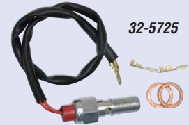
SINGLE BRAKE LIGHT BANJO BOLT 32-5725 Single, 3/8"-24 for 10mm 32-5726 Single, 7/16"-24 for 12mm