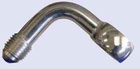
BANJO HOSE END, 90 DEGREE 32-6669 10mm Banjo End